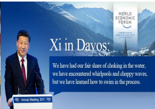
Xi in Davos: Quotable quotes