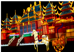
Chinese lanterns light up British gardens for Lunar New Year