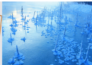
Snow turns Greater Hinggan Mountains a magical world