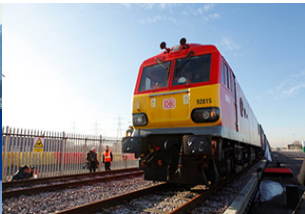
First freight train from China to London completes maiden journey

HOME CHINA CHINA- UK WORLD BUSINESS CULTURE LIFESTYLE TRAVEL SPORTS OPINION FORUM VIDEO